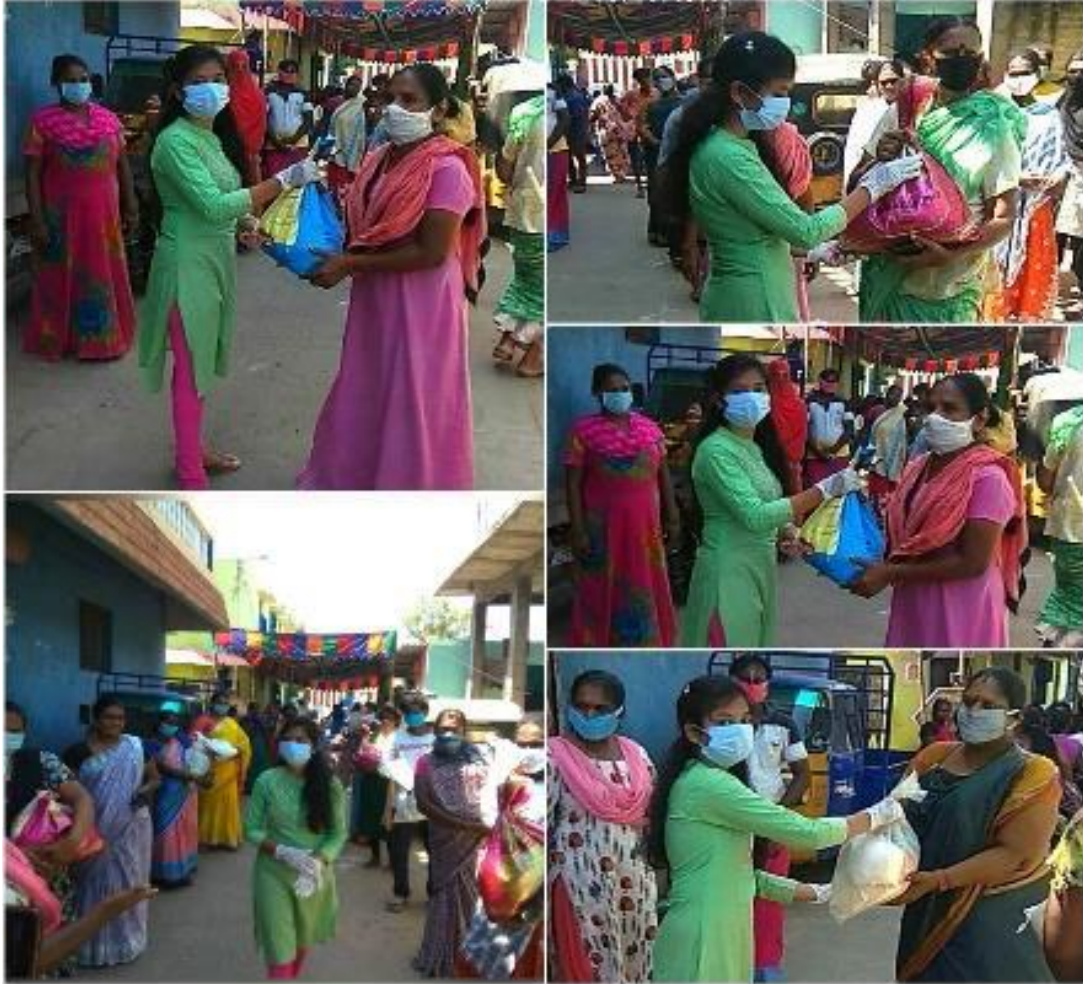
11. Supported 50 Families by providing kit in Alagapuri, Vennambatti, Athihalli, Annasavaram, Erangadu in Dharamapuri district